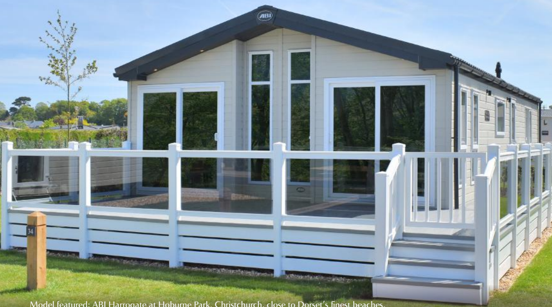
Model featured: ABI Harrogate at Hoburne Park, Christchurch, close to Dorset's finest beaches.

With eight superb holiday park locations, from sheltered forest and lakeside to stunning coastline, your Hoburne holiday home will always be your somewhere special. A place to relax. A place to escape.